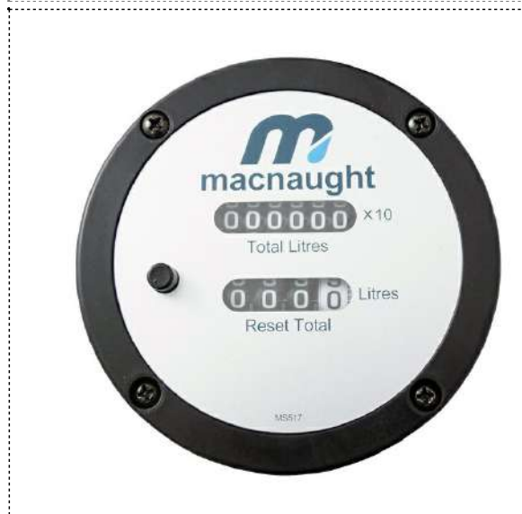
STANDARD MECHANICAL DISPLAY