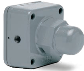
Optional air operated valve (AOV)

Available with a manually adjustable internal bypass valve (standard) or optional air operated valve (AOV) for high and low flow control.